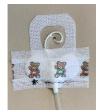
Long External Length

Place main dressing first, then securement device