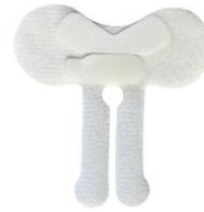
Large Size CVAD 4Fr or greater