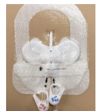
Short External Length

Place main dressing first, then securement device